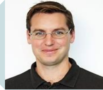
ENVIRONMENTAL CHANGE SPECIALIST