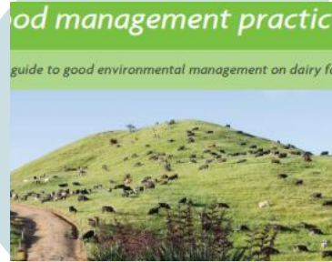
HARD COPY RESOURCES